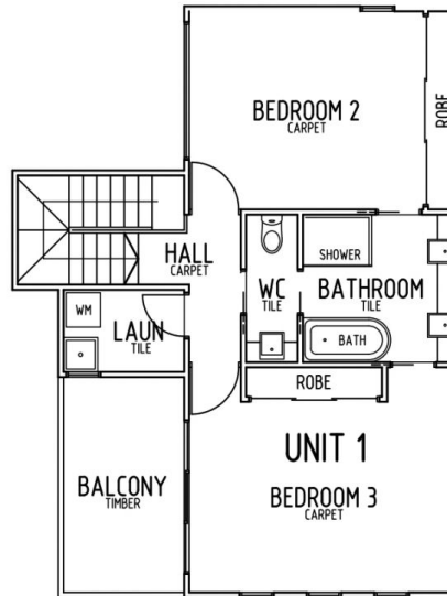
UNIT 1 FIRST FLOOR PLAN